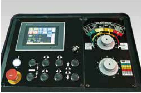
Easy to use control panel

The COSEN C-420NC, part of the Smart SNC-100 series, allows you to get all the benefits of digital control at a very low cost. The C-420NC can memorize up to 100 different jobs, which can all be of different length and quantity. It can compensate for the loss of thickness of your sawing material, completely eliminating the need for manual measuring. Other features of this machine are the automatic shutdown mode, an HMI display that shows the speed of your sawblade and life expectancy. The build-in error feedback system indicates when there is a problem. Whether it is cutting or in overhaul, it is easy to operate. Widely used in the cutting of round materials, round bars, round tubes, square tubes and various other materials, the COSEN SNC-100 series is the best way to pursue high productivity!