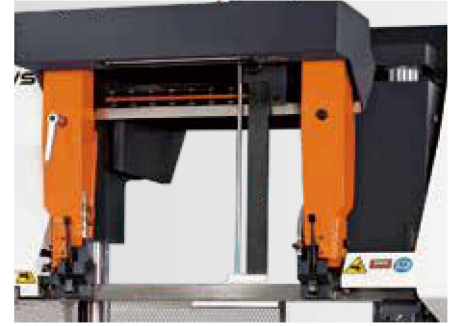
Robust double columns